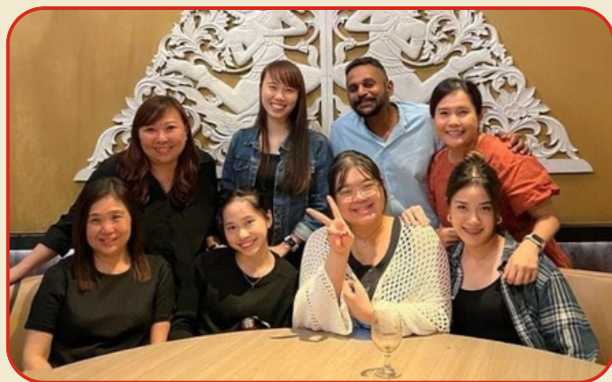
"Resume Builder" workshop for youths: Enhance your resume through a personalised review with HR professionals!

Prudential Singapore's Employee Value Proposition & Talent Acquisition team is dedicated to identifying and attracting top talent. With a keen eye for potential and a passion for connecting people with opportunities, we are proud to have been awarded the "Best In-House Recruitment Team (Gold)" at the Employee Experience Awards 2023, a testament to our commitment to excellence. Join this resume builder workshop to gain valuable insights and tips on crafting a standout resume that will help you achieve your career goals.