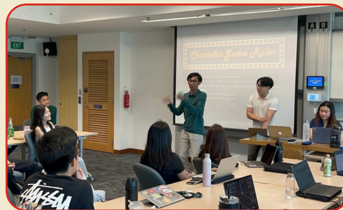
Workshop for youths: Understanding financial literacy concepts through games!

31ST JULY 17:00-18:30 1ST AUG 13:30-15:00 2ND AUG 15:00-16:30