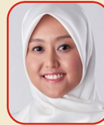
Ms Rahayu Mahzam Minister of State, Ministry of Digital Development and Information & Ministry of Health Day 1 Opening Address

As we step into the future, the young minds of Gen Zs stand at the forefront. With their fresh perspectives, innovative ideas, and digital fluency, they are the trailblazers of tomorrow. But every trailblazer needs a guide, and that’s where mentoring comes in. This day, we delve into the transformative power of mentoring. we’ll discover how mentoring can help Gen Zs navigate the complex labyrinth of the professional world!